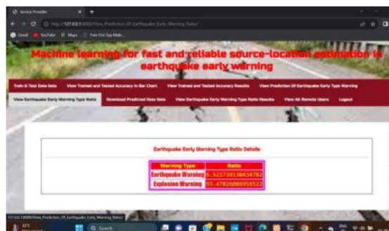
Fig.3. Accuracy level indication.

https://doi.org/10.62651/ijmert.2024.v16.i3.pp151-156